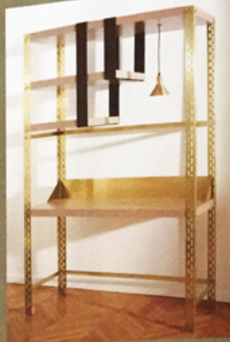
CLOCKWISE FROM FAR LEFT, ANOTHER IN PERI'S 'SHAPES' LAMP SERIES AND HIS 'LIVING IN A CHAIR' WITH MULTIPLE STORAGE OPTIONS. CRAFTED FROM BRONZE, GLASS AND WOOD, AND A MARBLE IPAD STAND. 'SCAFFALE D'ARTE' WORKSTATION IN BRASS, WOOD AND LEATHER, AND 'PANCHETTA SOFA