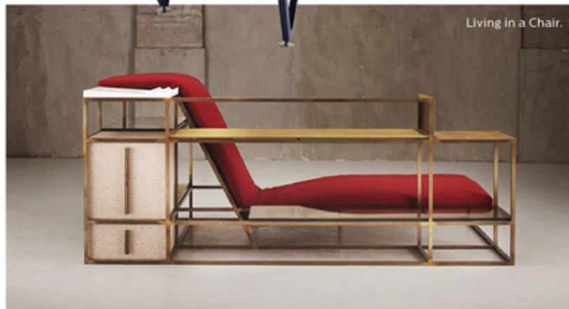
Living in a Chair.