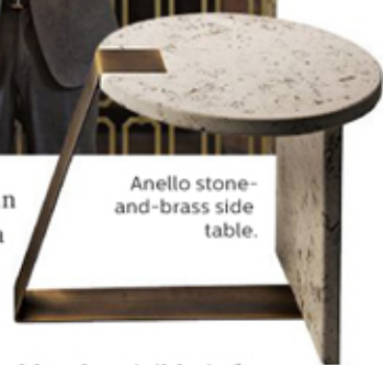
Anello stone-and-brass side table.

two wheels, so it can be moved like a wheelbarrow, while the arrangement of rods in his pendant lights was suggested by the visible infrastructure of a factory ceiling.